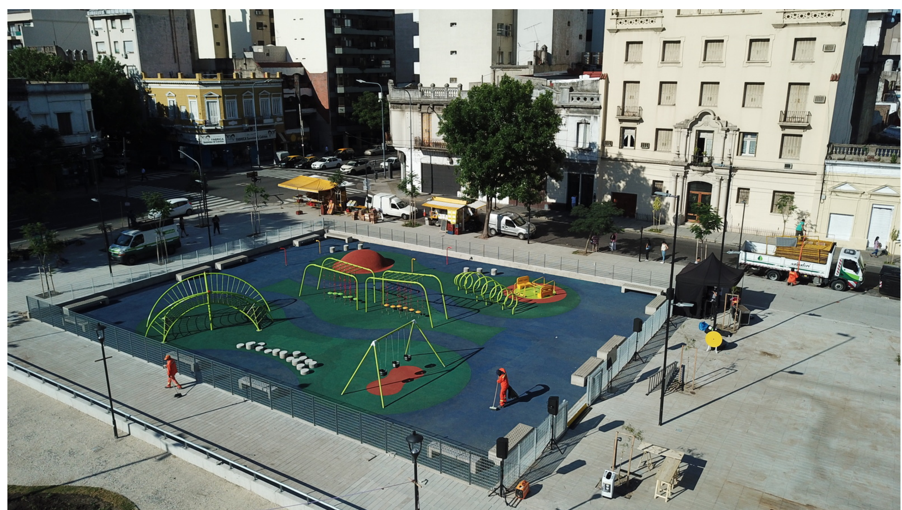
Manzana 66 park in Buenos Aires.

The projects are largely successful; the citizens not only enjoy new public parks, streets and open spaces, but also engage more often in participative processes that involve them. This way, the methodology becomes full-circle and the city is enhanced in multiple ways; streets become safer, public spaces are friendlier and more inclusive, and the government is aware of the needs of the people and the city as a whole.