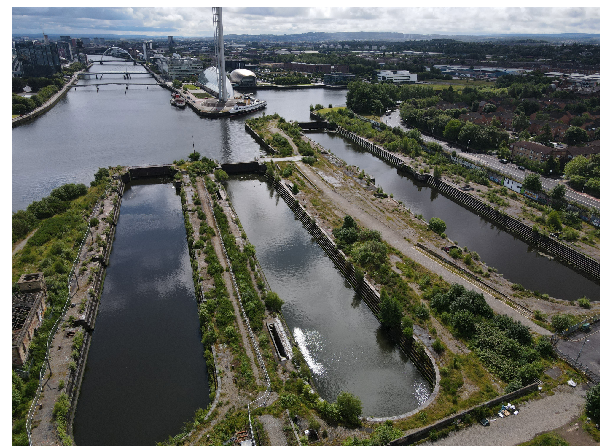
Govan Graving Docks in their current state