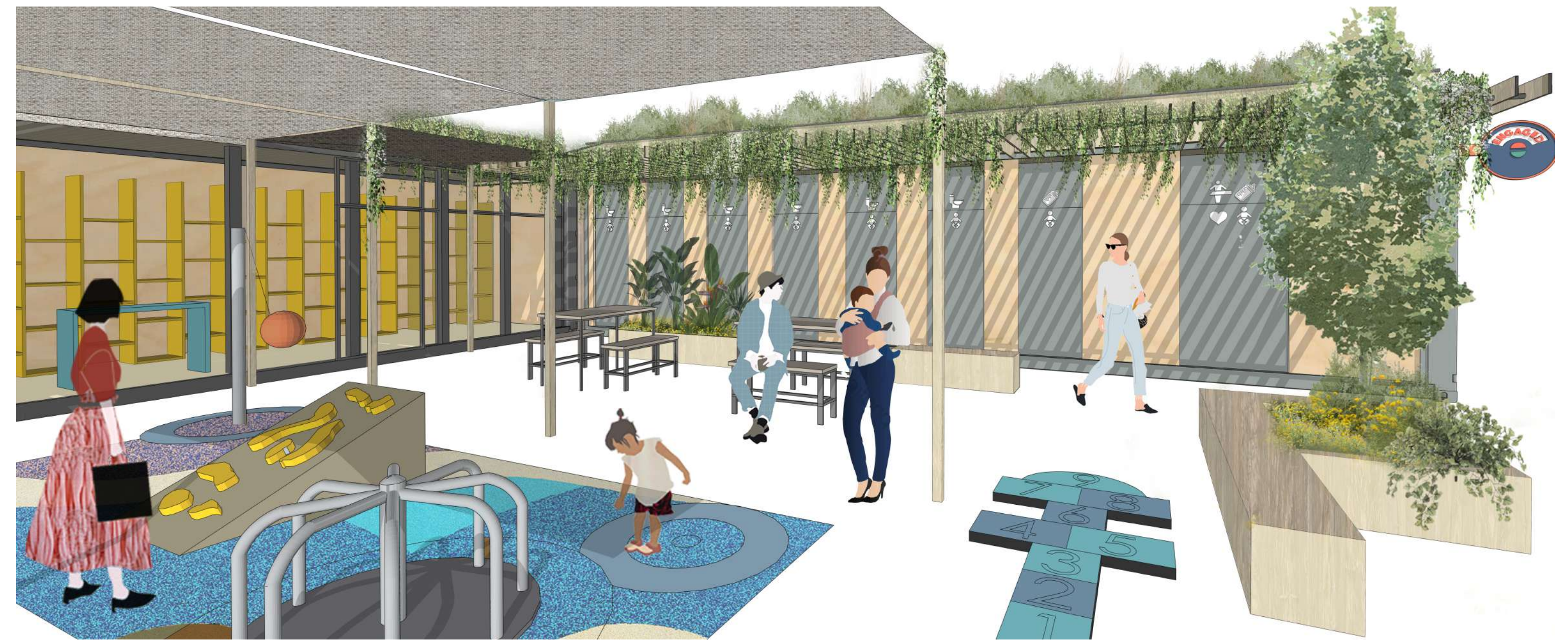
Engaged Toilet + Toys Library

The three elements of community, inclusive design and public health make up the sustainable foundation of the Engaged concept.