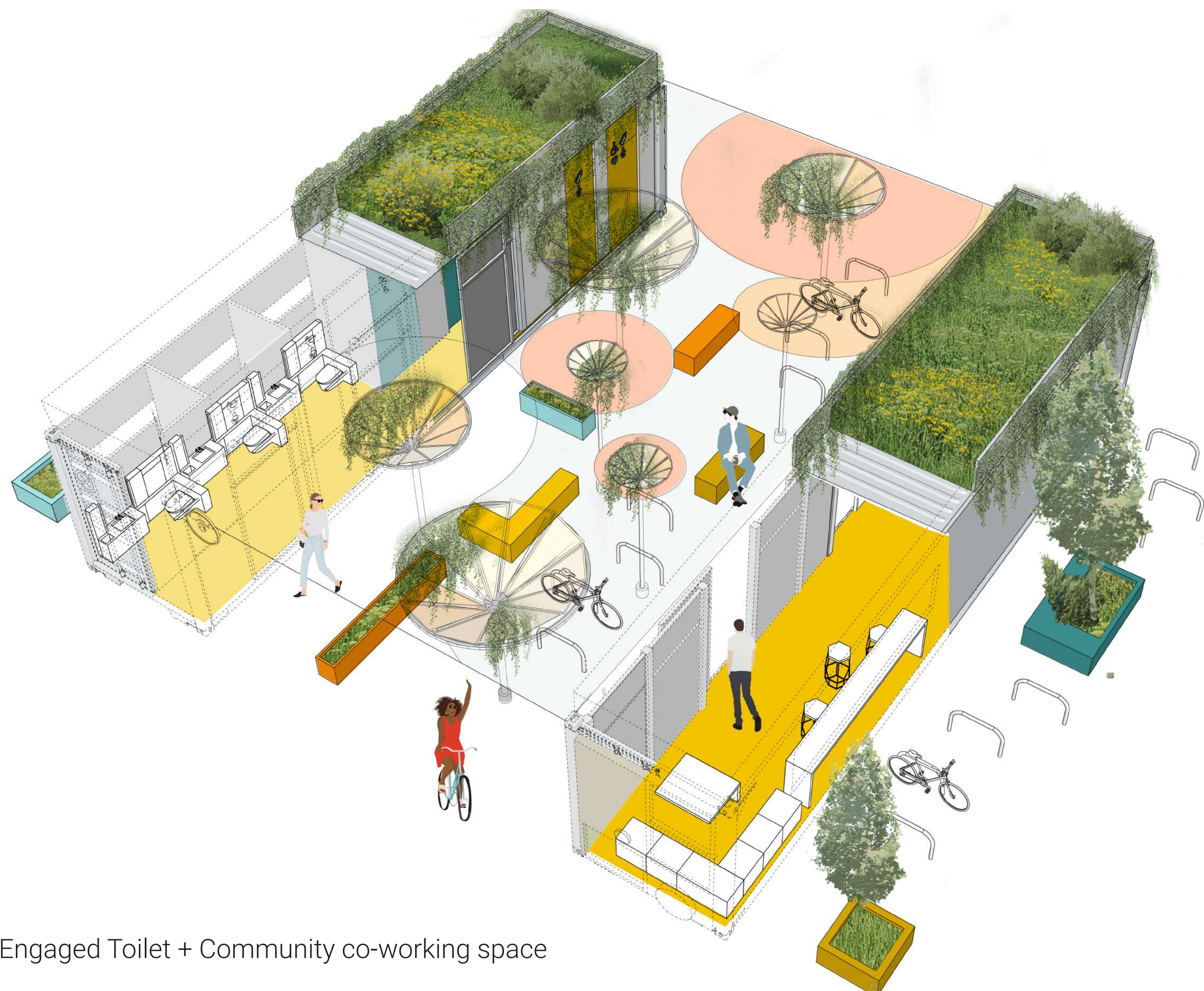
Engaged Toilet + Community co-working space

In concept design scenarios, we have considered uses such as a toy library, community café or library, delivery riders hub and other outlets, with the idea that uses should be site specific and decided in discussion with local communities.