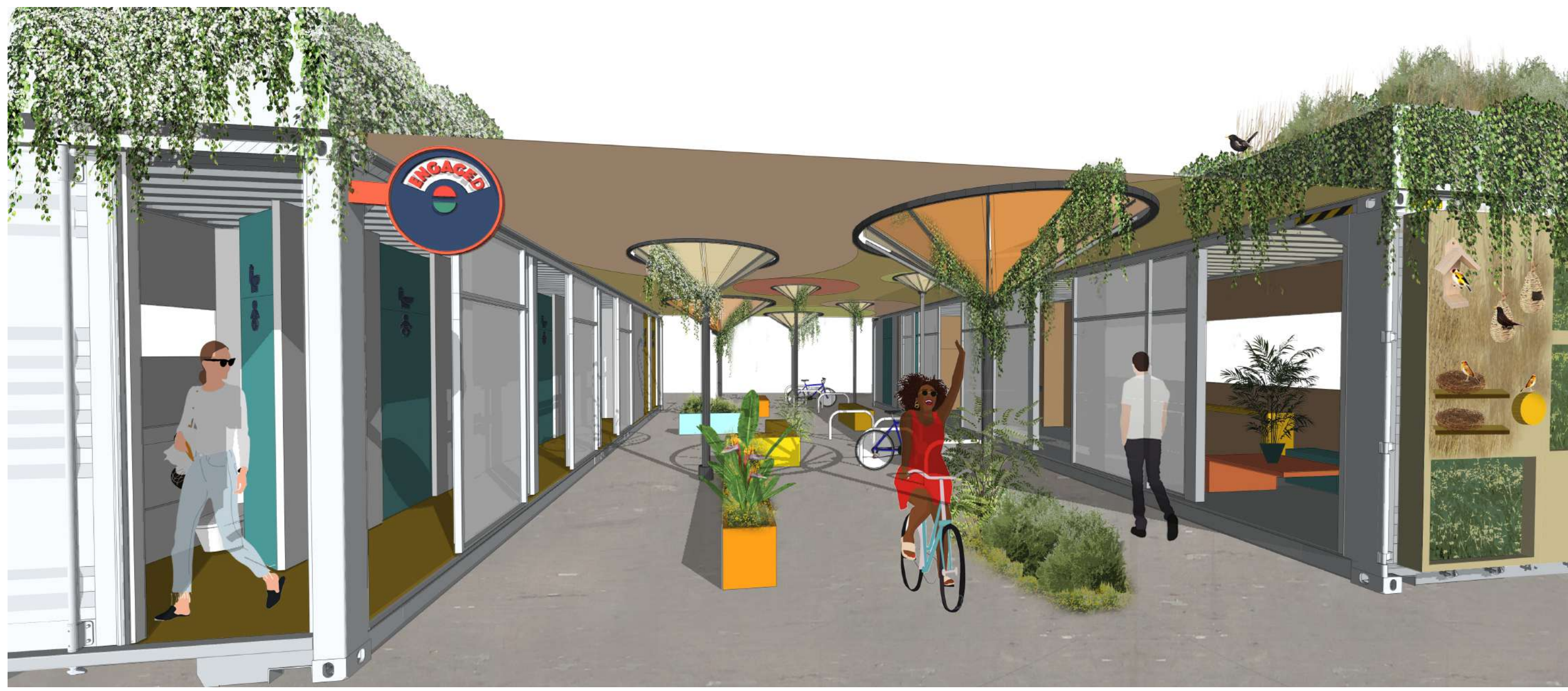
Engaged Toilet + Community co-working space

The Engaged concept aims to give councils a sustainable way of providing an inclusive, accessible public toilets that can support local demand, without the pitfalls of the traditional toilet block.