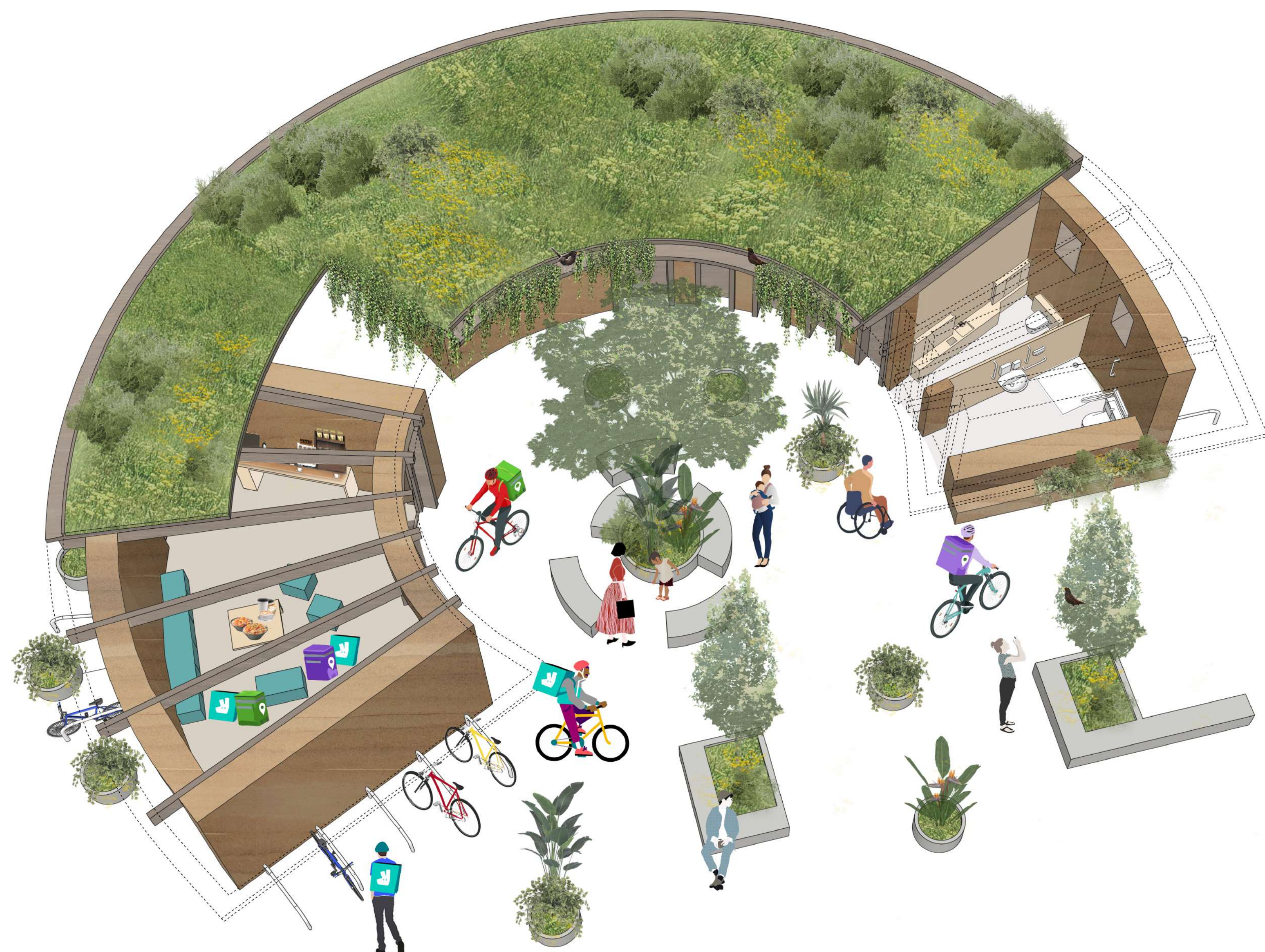
Engaged Toilet + Delivery Riders Hub